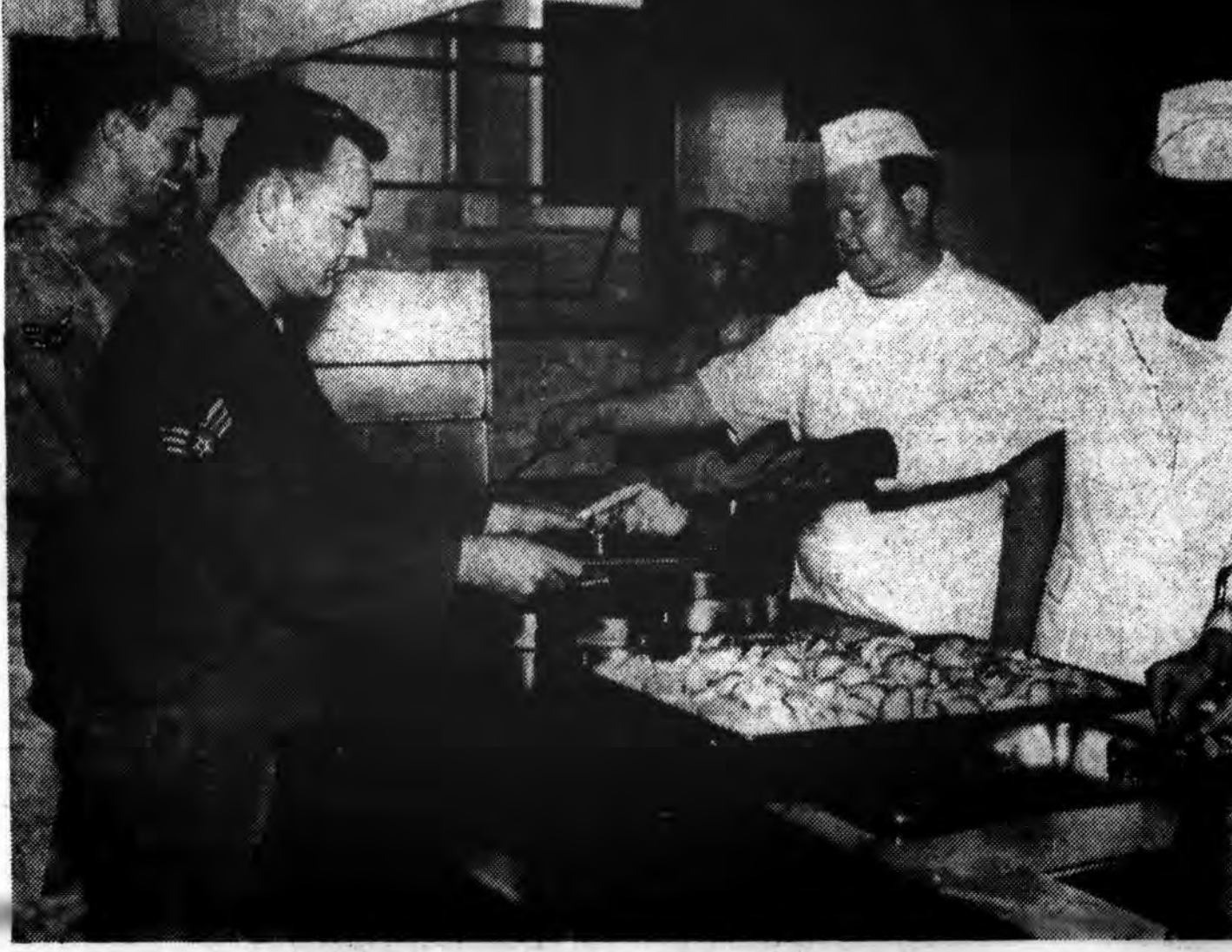
CHOW TIME—Hefty cook is living advertisement of the quality and quantity of the food at the base.