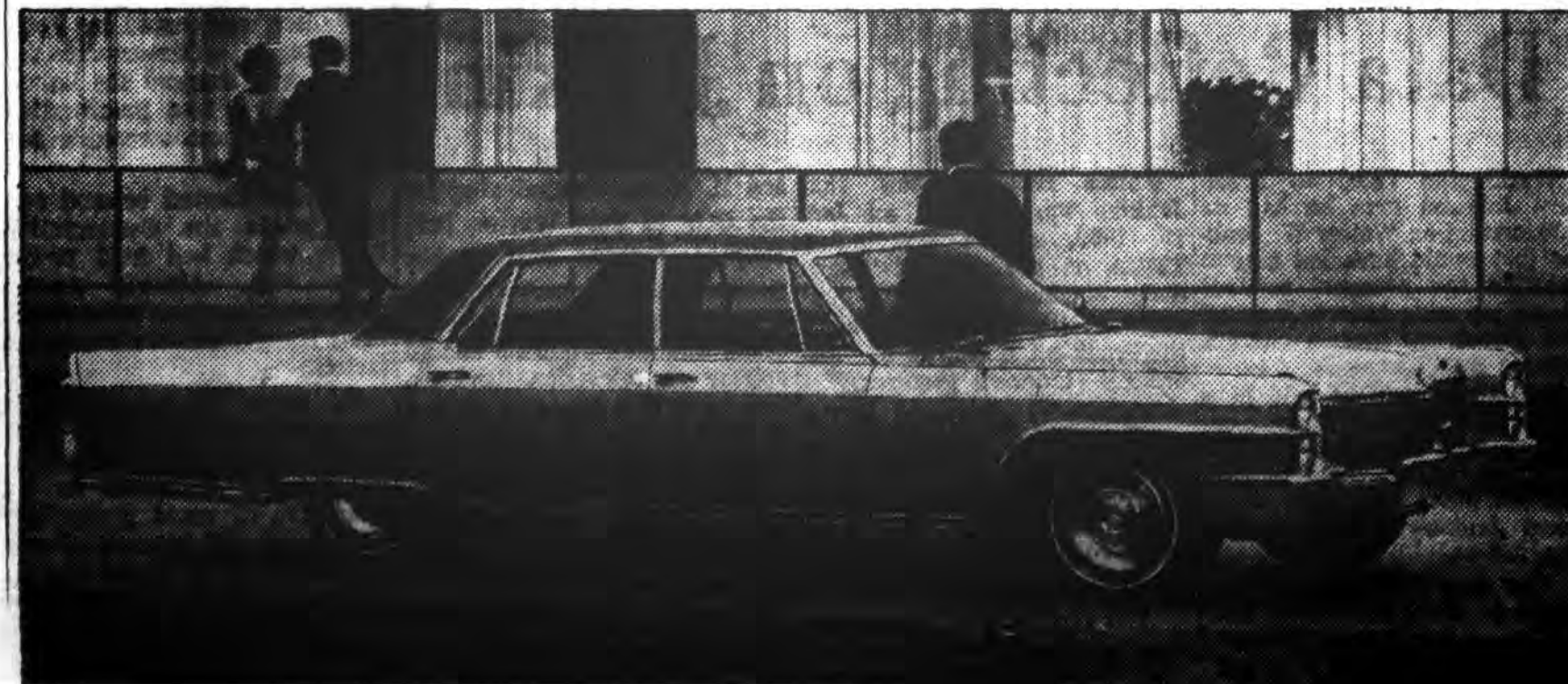
At top, the Sedan de Ville; below, the longer-wheelbase Fleetwood Dreamliner.