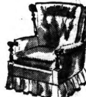
Early American Barrel-Shaped Swivel Rocker $99.00