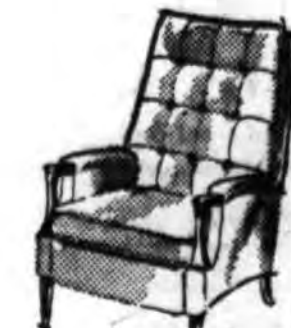
Modern Reclining Relaxer Biscuit-Tufted Back $119.00