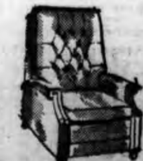
Lounge-chair Styling in this High Back Reclining Relaxer $86.00