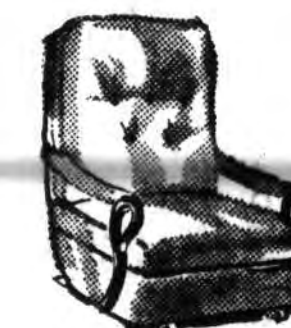
Platform Rocker with Distinctive Gooseneck Arms $69.00