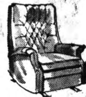
King Size Rocker Relaxer $98.00

SARATOGA Open Daily 8 to 9, Sat. 'til 6 p.m. Mechanicville Corinth, Thurs. & Fri. 'til 9