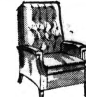
Modern High-Back Reclining Relaxer $99.00