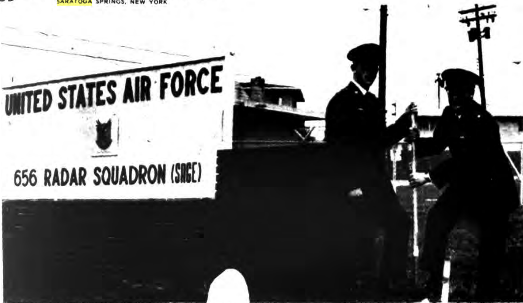
BEAUTY AND THE BASE — The Saratoga Air Force Station was subject to a beautification project when the State Tree Nursery donated 200 red pines to the base. Planting the last two of the trees in front of the squadron sign outside the main gate are Airman First Class Wharton, left, and squadron commander, Major Black.