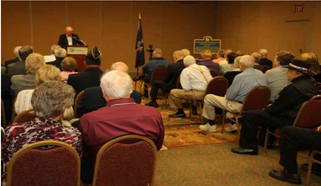
Dedication ceremony at the Holiday Inn in Saratoga Springs, NY

The morning after the dedication ceremony, several 656 th veterans went to Ketchums Corners and installed the historical marker on its pole. A video of the dedication and other photos can be viewed by going to the 656 th Radar Squadron website http://saratogaradar.org/ Once the home page opens, click on the link titled “656 th Historic Marker”. When that page opens, click on the “Photos” link.